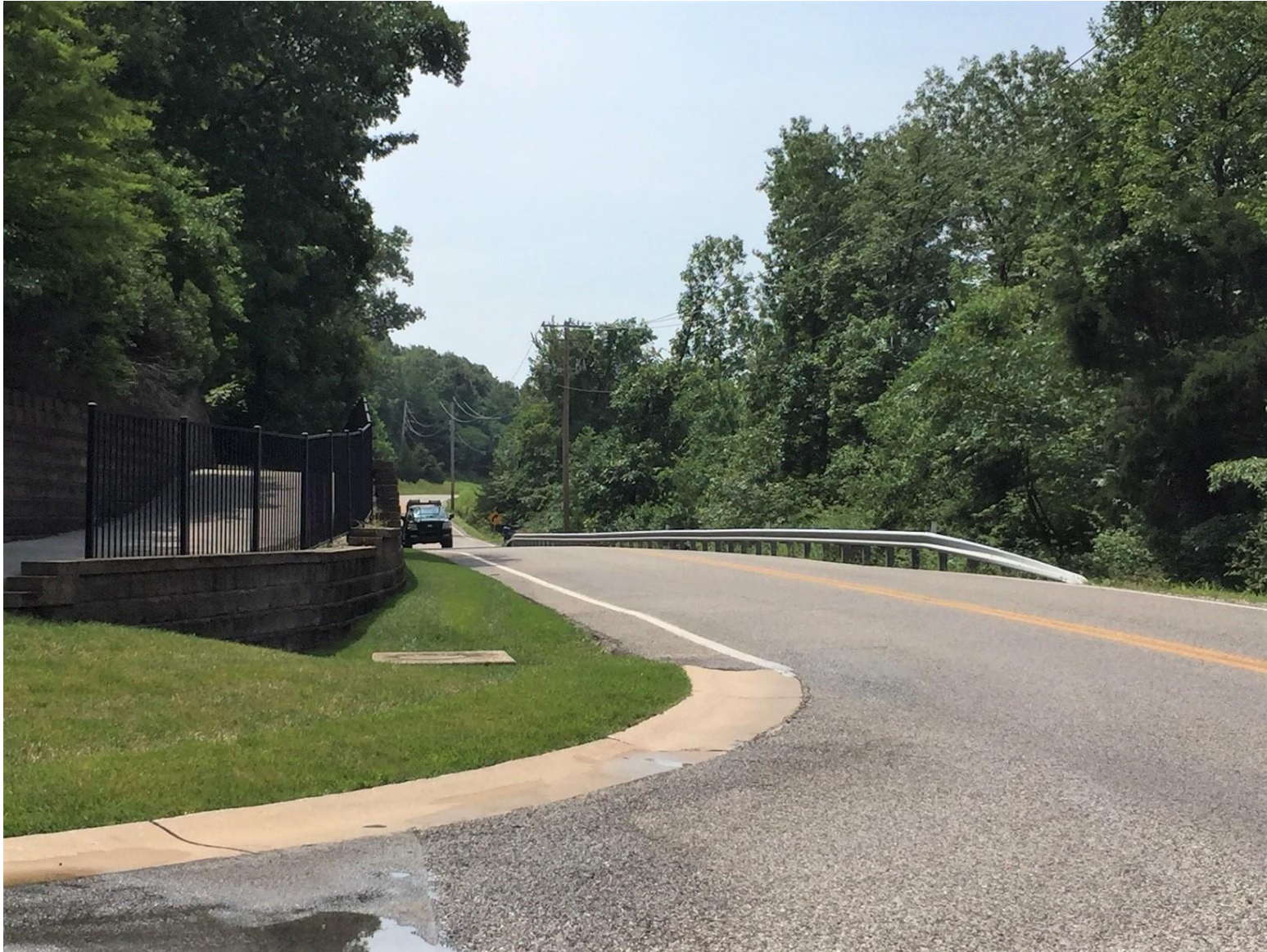
Exhibit 2 – Existing Sight Distance – Strecker Road Looking South