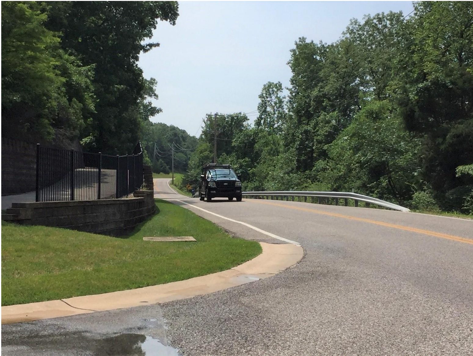
Exhibit 3 – Existing Sight Distance - Strecker Road Looking South