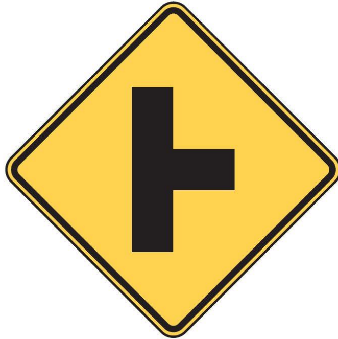
Exhibit 4. Proposed Intersection Warning Sign