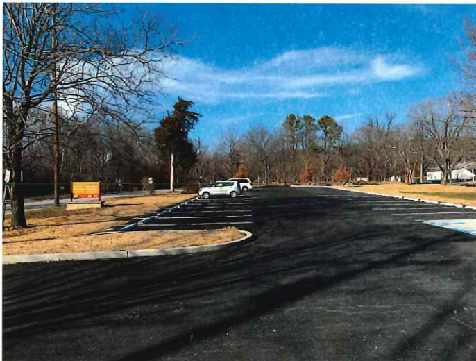
View of new parking lot looking west

With several days of favorable weather late in the year, the contractor was able to complete the project, including the striping of the spaces. The project was completed on-budget and on-time. Photographs below show the new parking lot: