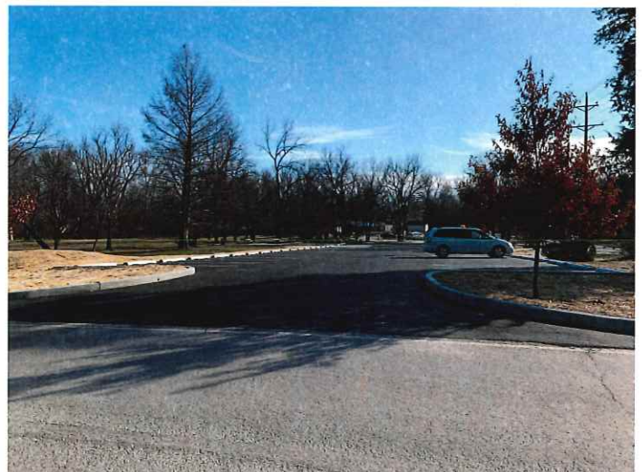
View of new parking lot, from Third Street, looking east