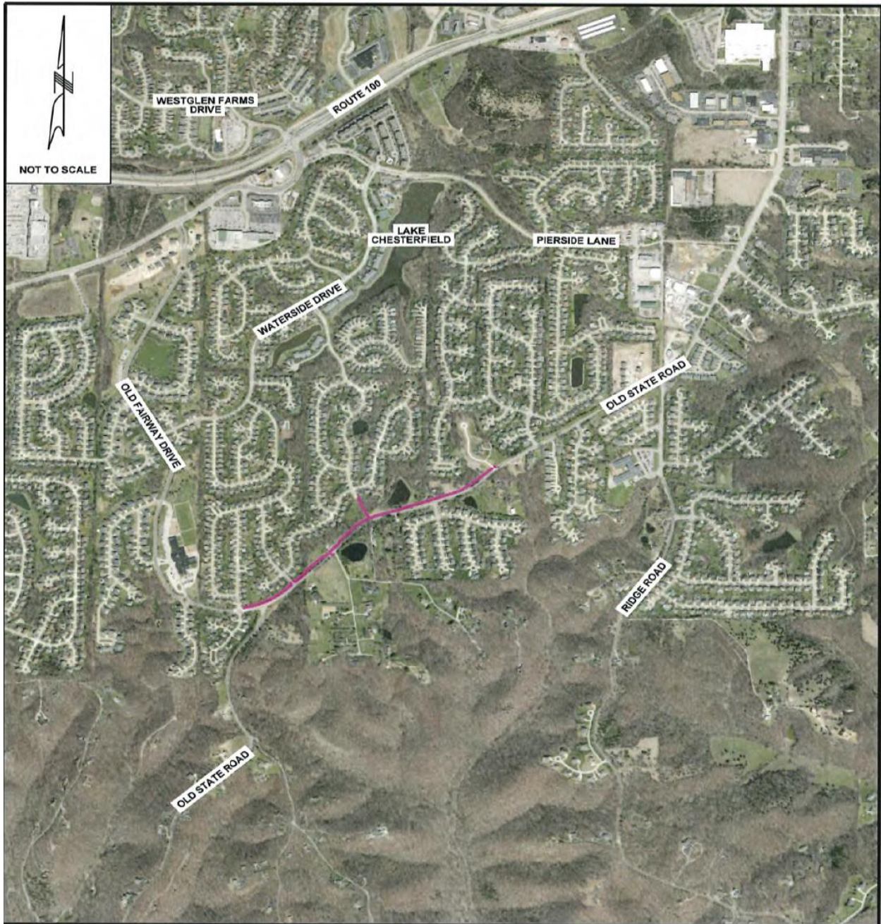
Exhibit A - Location of Project