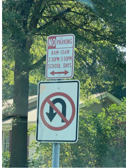
Exhibit 2: Parking and U-Turn Restrictions near Marquette High School