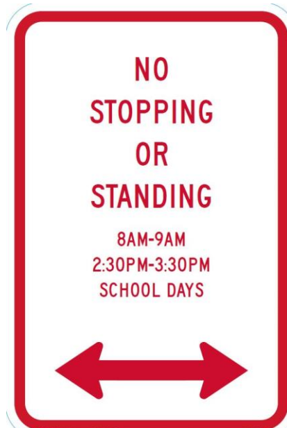
Exhibit 3: No Standing or Stopping Sign