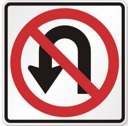
Exhibit 4: No U-Turn Sign