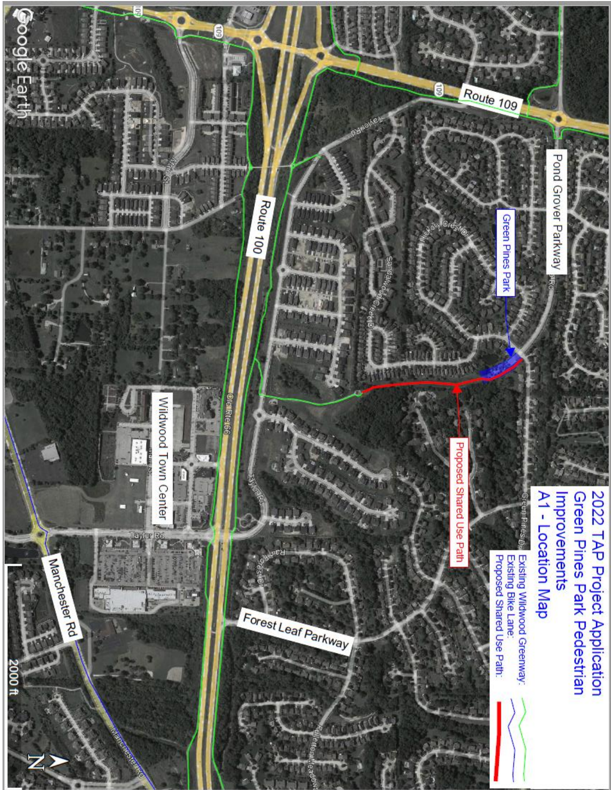
Exhibit A - Location of Project