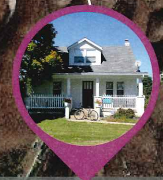
ANNIE RICKARD HOUSE 17011 Manchester Rd 1930