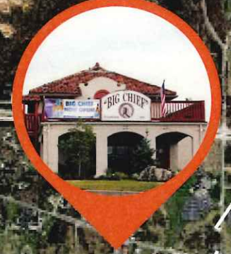
BIG CHIEF ROADHOUSE 17352 Manchester Rd 1928