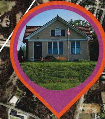
OLD POND SCHOOL 17123 Manchester Rd 1914