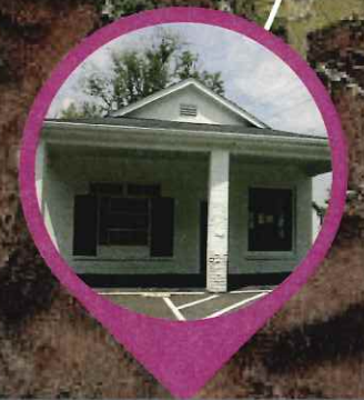
KERN SERVICE STATION 17301 Manchester Rd 1925